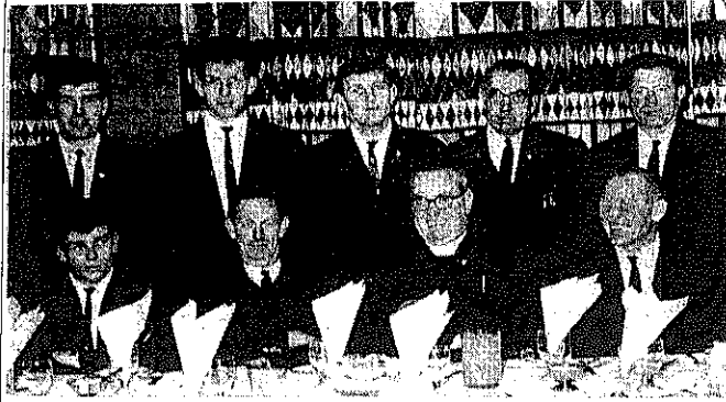
Photographed at the Clashmore G.A.A. Clubs Annual Social in Lawlor's Hotel, Dungarvan, recently were members of the Club Committee.