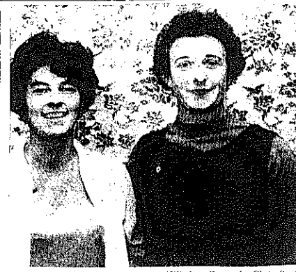
SOCIAL SEASON Present at the Kibrien Camogie Club Social at the Devonshire Arms Hotel, Dungarvan, recently were Miss...

Here are some hints from the Post Office which will help you with your Christmas Mail.