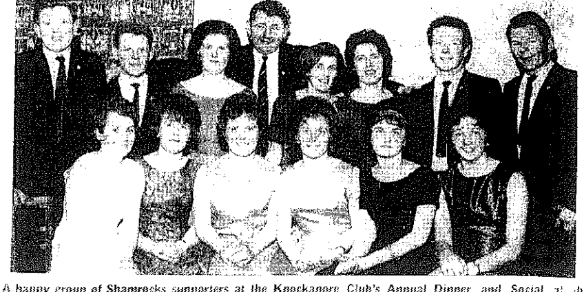
A happy group of Shamrocks supporters at the Knockanore Club's Annual Dinner and Social at Park View Hotel, Youghal.

Loan For Hospital repairs Approved... A loan for hospital repairs has been approved.