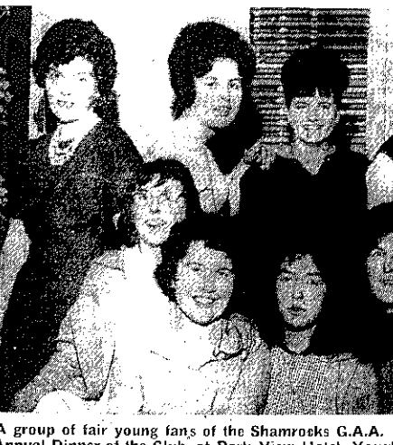
A group of fair young fans of the Shamrocks G.A.A. Club who attended the Annual Dinner of the Club at Park View Hotel, Youghal.