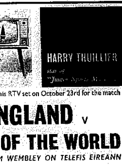
will be watching his RTV set on October 23rd for the match