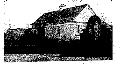
The new Schoolhouse at Kilmoran, Co. Limerick, which had running water installed under the Group Scheme.