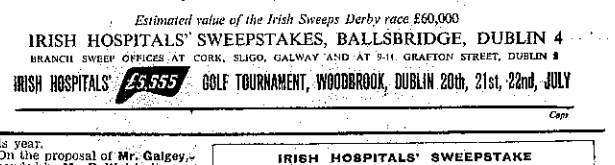
Estimated value of the Irish Sweeps Derby race £60,000

IRISH SWEEPS DERBY Don't fail to participate in the Sweepstake on this great race. Get your ticket to-day. Tickets £1 each.