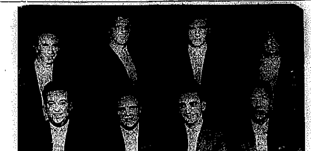
Members of the Dixielanders Showband (Cork) who will be playing at the Town Hall, Dungarvan, on next Tuesday night.