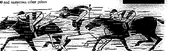
Estimated value of the Irish Sweeps Derby race £60,000

In the Comprehensive Sweepstake 1961 there were 28 prizes each of £50,000, 28 prizes each of £20,000, 28 prizes each of £10,000 and numerous other prizes