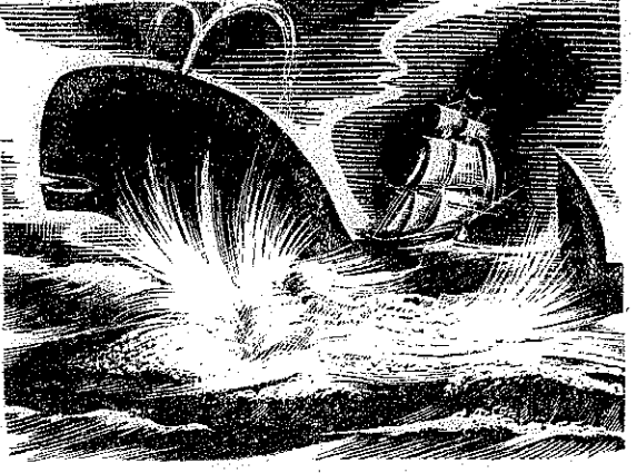
by chance . . .

The following little story comes from Rathfriland area of Old Parish. A farmer was troubled with crows damaging his crop. On a stroke six feet high he set a trap. Imagine his surprise when he visited the trap on the following morning to find not a crow but a snake. The snake was six feet high and it's a mystery what attracted the snake to the trap.