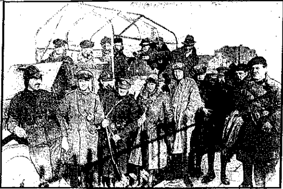
A group of Black-and-Tan officers pictured in Dublin beside a Crossley Tender fitted with a wire cage. It was such men who directed the shootings at Croke Park on Bloody Sunday.

A very large contingent took part in the St. Patrick's Day Parade where many old friends met and new friends were made. The full story of Bloody Sunday has never been told, but now, for the first time, there is a vivid, gripping eye-wit-