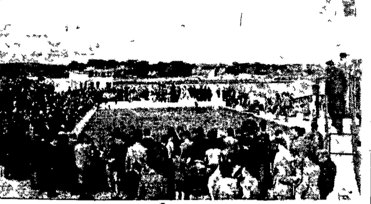
Dungarvan Swimming Pool on a Gala Day

The trophies for the various competitions are at present on display and it is expected that the number of competitors will top the 1,000 mark.