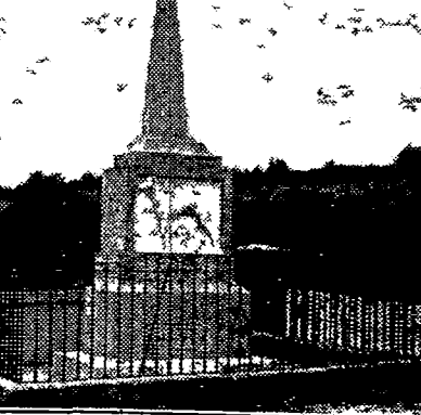
Above is the Monument to the Famous "Master McGrath" at the junction of the Dunganvar-Clonmel Road See "Spotlight" Column in the "Leader" of March 24th, for the words of the well-known Ballad

PAROCHIAL HALL, BALLYMACARBRY ON SUNDAY, 8th APRIL at 8 p.m. ON TUESDAY, 10th APRIL at 8.30 p.m. ON SUNDAY, 15th APRIL at 8 p.m. AND AT THE HALL, NEWCASTLE ON THURSDAY, 12th APRIL at 8.30 p.m. ON FRIDAY, 13th APRIL at 8.30 p.m.