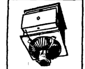
The Electric Grain Dryer Price £34 10 0