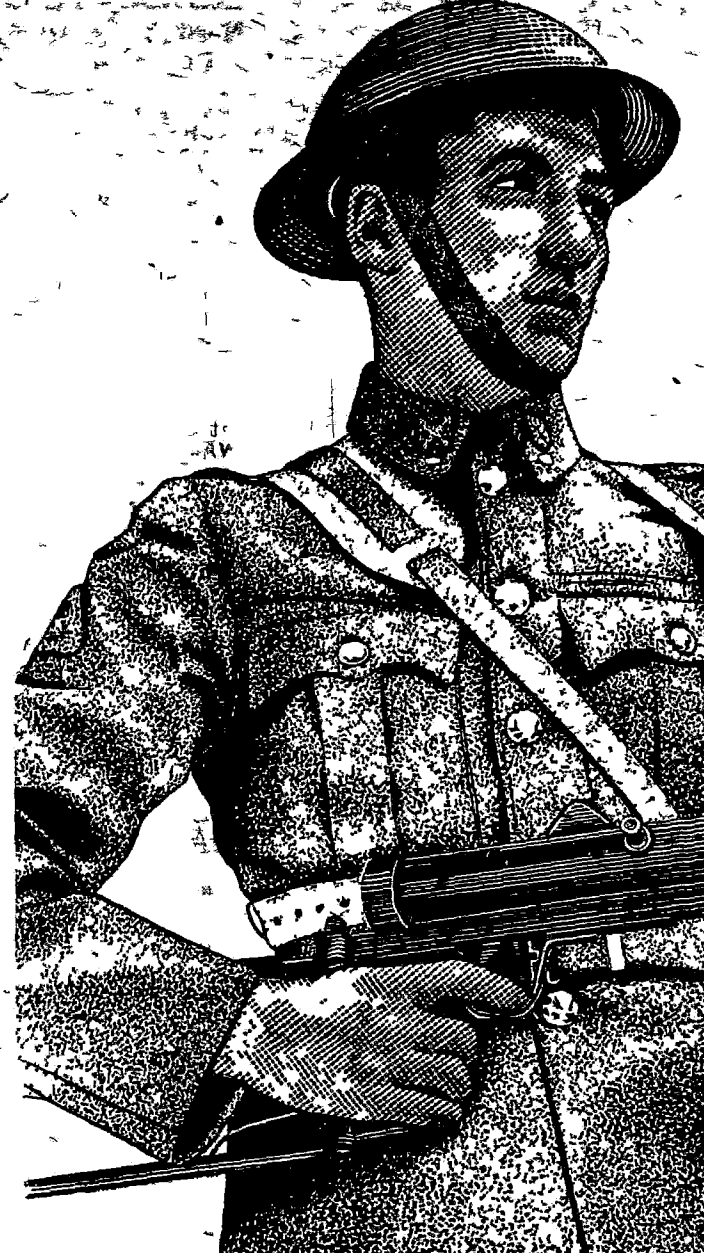
The young man who joins the Army to day is serving his country and at the same time enjoying a life full of interest and action...