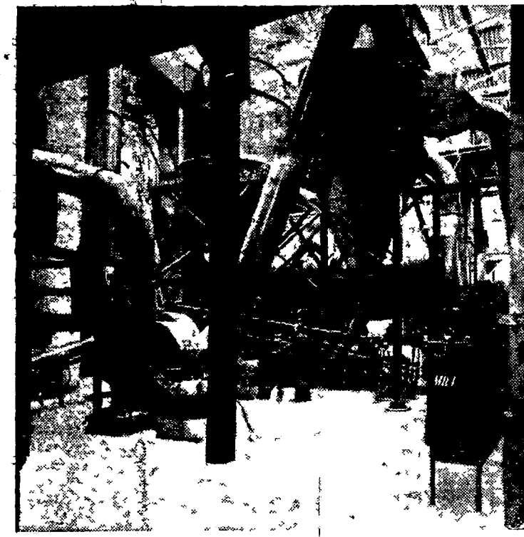
GOOD NEWS FOR WATERFORD —This big new granulating plant (enabling compound fertilisers to be prepared for use in combine drills) in the Waterford factory of W & H M Goulding & Co, will bring more ships and extra employment to this southern port. The new plant is capable of handling 25,000 tons per annum and will be worked 24 hours a day to provide for the Irish farmers needs

Johnny O'Connor was the star of the back-line in the Students' team which held the