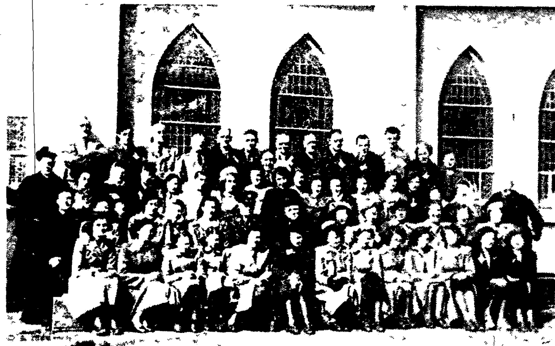
Members of the Friary Bazaar and Carnival Committees who are organising the functions in aid of the Dungarvan Friary Building Fund