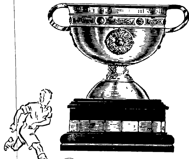
The ALL-IRELAND FOOTBALL CHAMPIONSHIP TROPHY