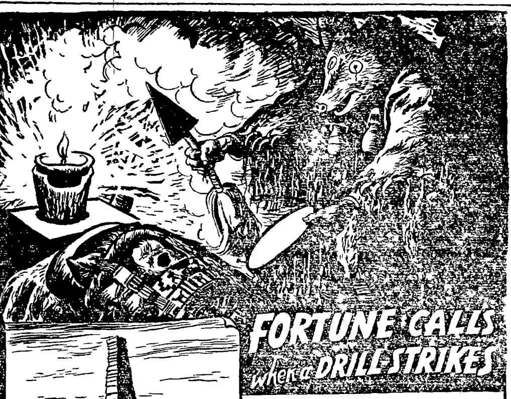
FORTUNE CALLS when a DRILL STRIKES. Petroleum, well known to North American Indians and their Medicine Men as a fuel and medicine, was called 'Seneca Oil'

Good Luck.—On Sunday next the local junior hurlers and footballers meet the Rebel County in the Munster semifinals and all Waterford Gaiels join in wishing them the best of good luck for the first round. They beat the famous Clare teams and on Sunday will be all out to mark Cork's account. Beating Cork is no small achievement, but the motto should be never for nothing. No matter how the score goes you are never beaten until the final whistle so never give up trying. Good luck lads.—Up the Blues!