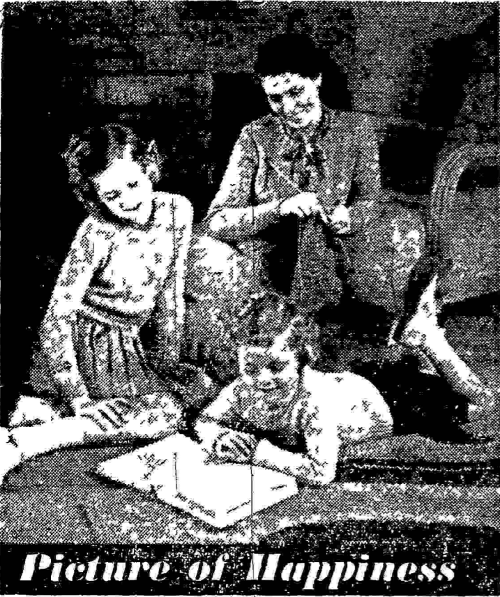
Picture of Happiness

The evening clos- in The title family draws to the frside No fears for the future in this household The young wife is happy in the certain knowledge that in the most extreme event she and her children will be assured of adequate financial protection.