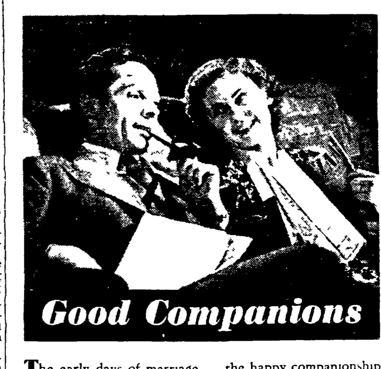
Good Companions The early days of marriage - the happy companionship of your wife - the joy of relaxation in your home after the arduous of the days work - these are memories which will never die